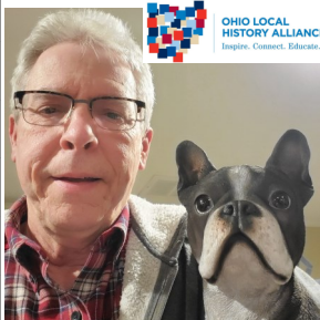
OHIO LOCAL HISTORY ALLIANCE Inspire. Connect. Educate.