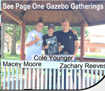
See Page One Gazebo Gatherings