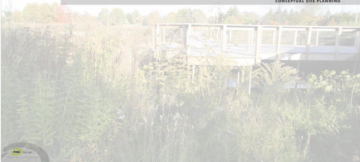
CONCEPTUAL SITE PLANNING | West Side Park

ASHVILLE VILLAGE PARKS | PICKAWAY, OHIO CONCEPTUAL SITE PLANNING