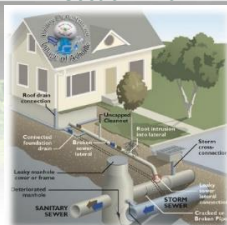
I & I