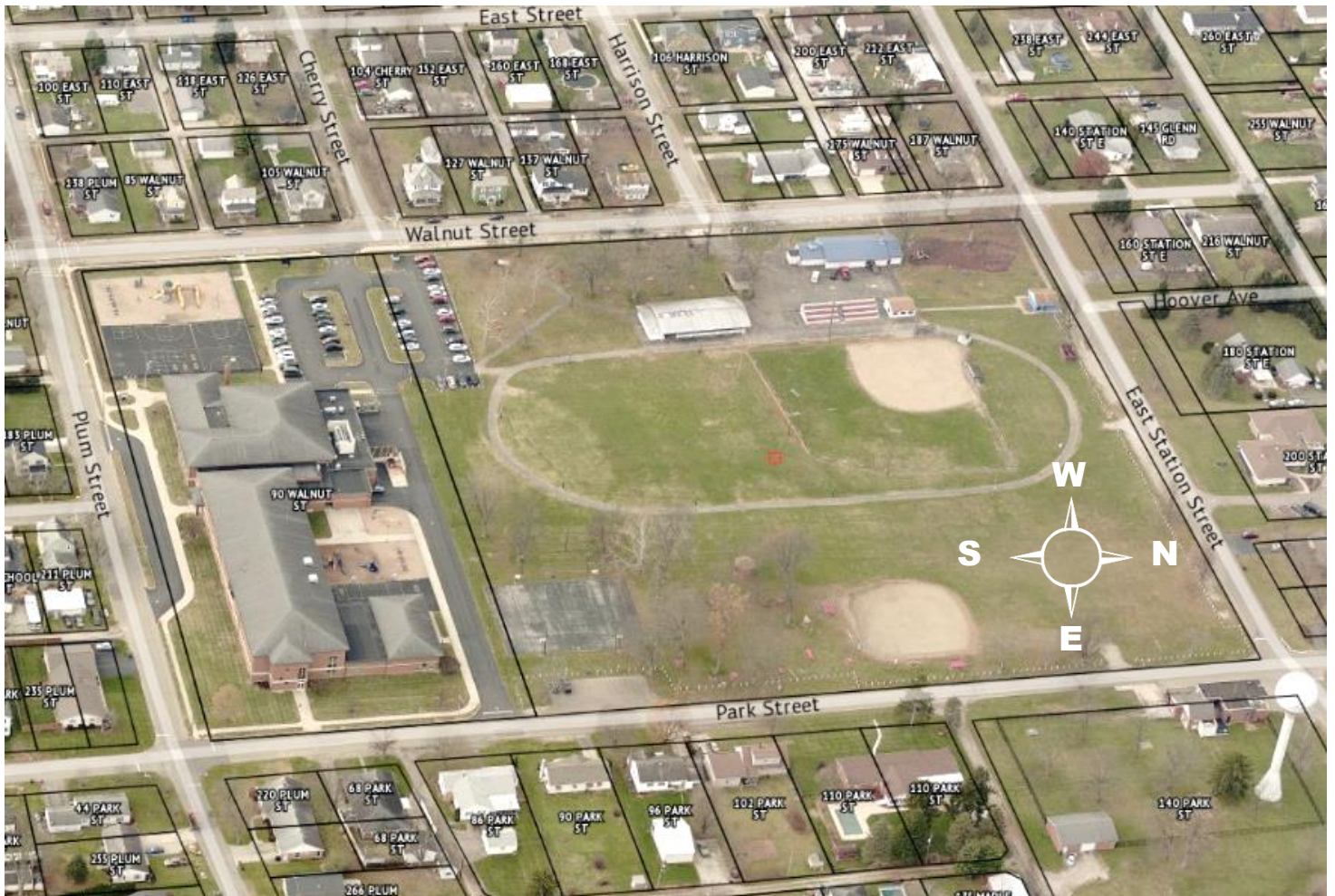
Photo Album History and future of the Ashville Park