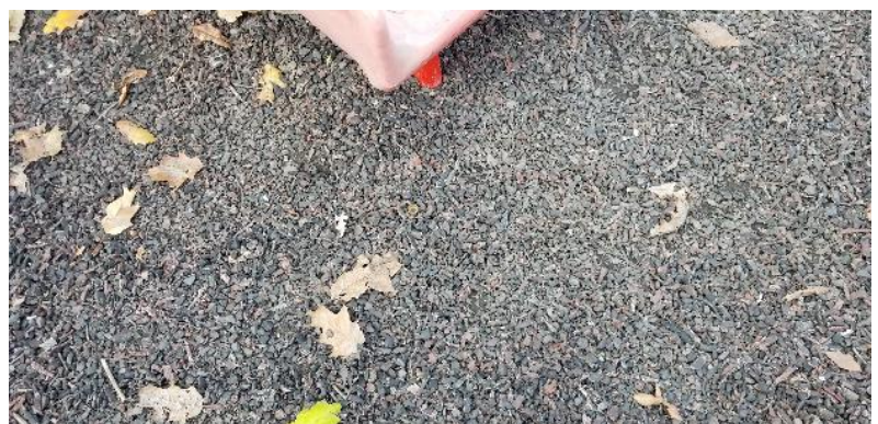
Surfacing is too thin (lacking proper depth). Concrete footers are exposed.