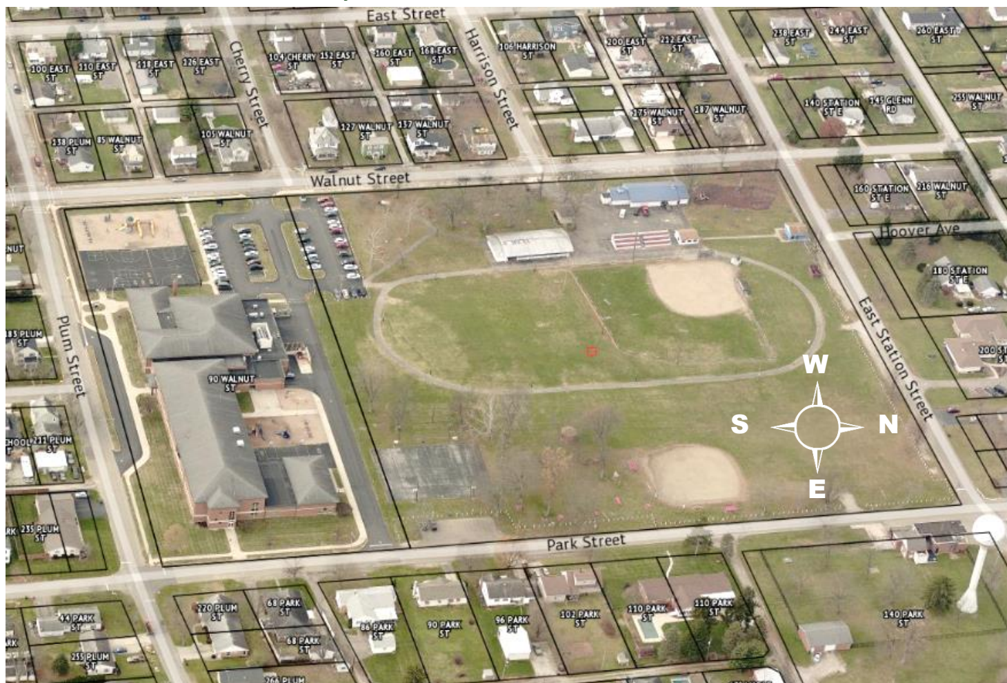
Photo Album History in and the Ashville Park