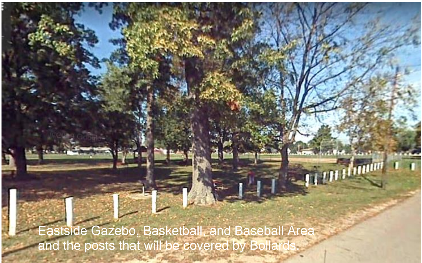
Eastside Gazebo, Basketball, and Baseball Area and the posts that will be covered by Bollards.