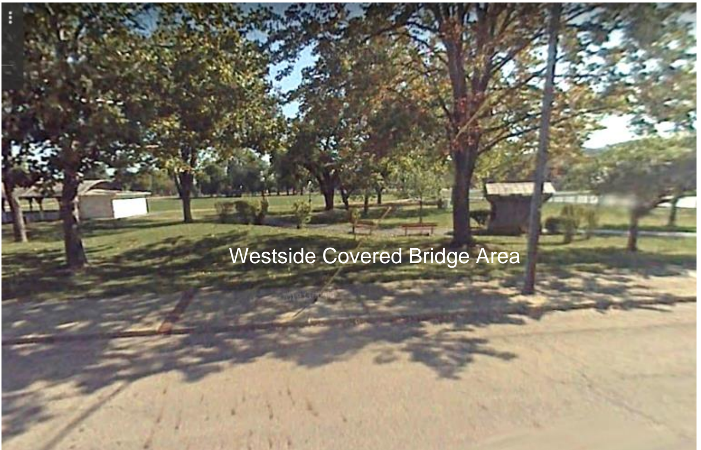
Westside Covered Bridge Area