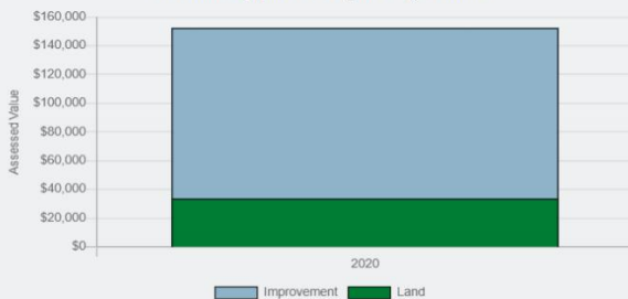
Historic Appraised (100%) Values