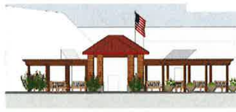
PROPOSED NORTHWEST ELEVATION