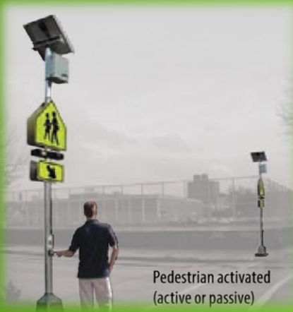
Pedestrian activated (active or passive)