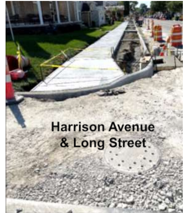
Harrison Avenue & Long Street