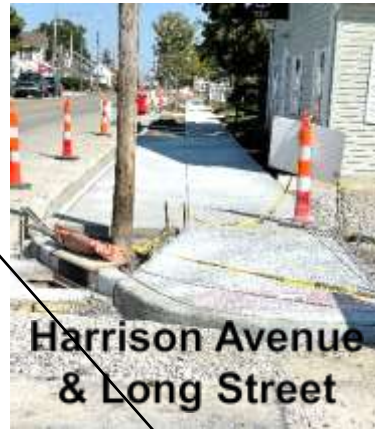
Harrison Avenue & Long Street