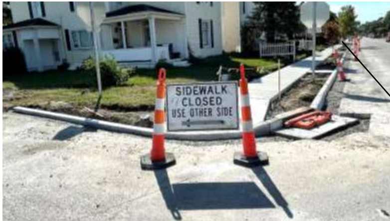
Station & Long Street North to South