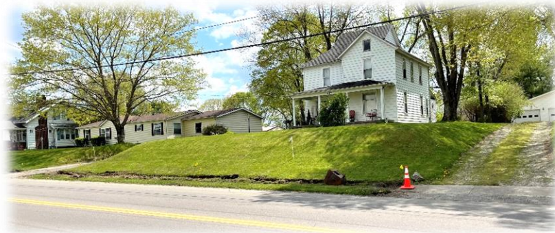
West Main Street